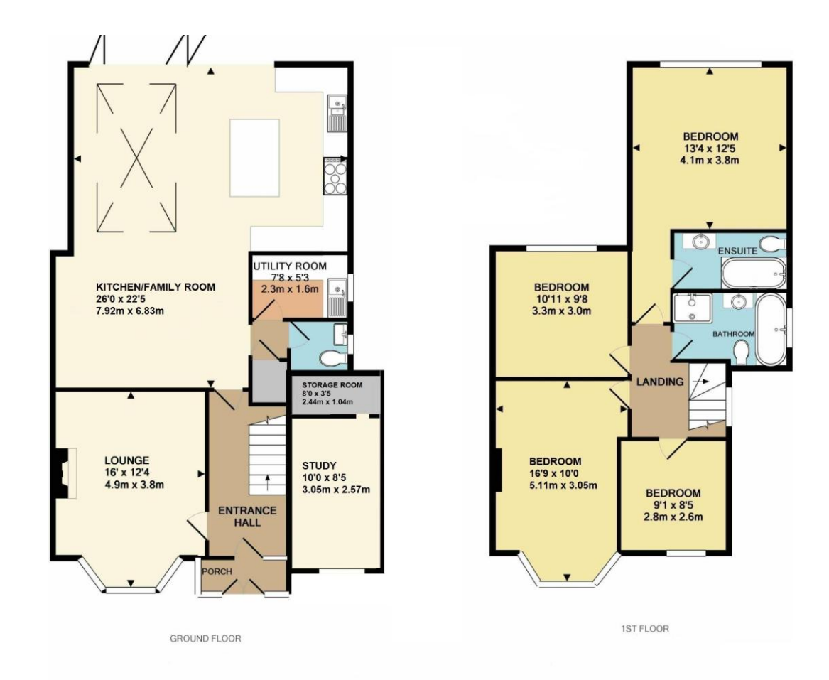
ery attempt has been made to ensure the accuracy of the floor plan contained here, measurement windows, rooms and any other titems are approximate and no responsibility is taken for any error in, or mis-statement. This plan is for illustrative purposes only and should be used as such by any we purchaser. The services, systems and appliances shown have not been tested and no guarants as to their operability or efficiency can be given Made with Metropix 62017.