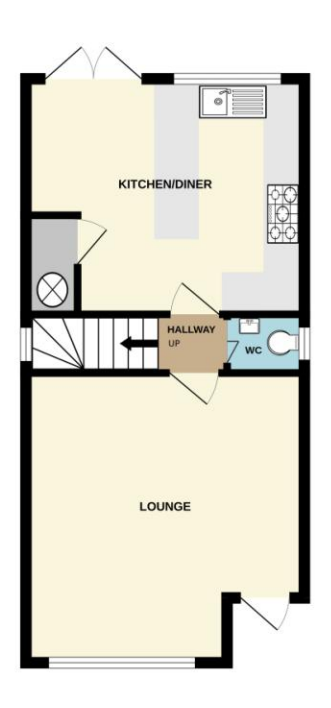
GROUND FLOOR 415 sq.ft. (38.5 sq.m.) approx